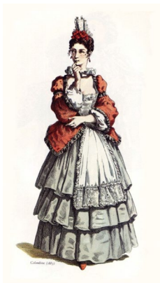
COLUMBINA The house maid

different characters competing for the affections of the innamorata. This love story is at the heart of the play and it is the thing that prompts the other characters to take action.