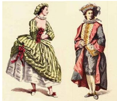
Innamorati The Romantic Leads Description: In traditional Commedia, the romance between the innamorati is the driving plot of the show—it may be a story of lovers separated by circumstance, or it could be a tale of

Description: A rich and greedy miser. He is obsessed with money. He is always after women and thinks he's good at it. He is gullible and often tricked.