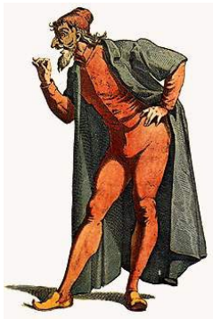
PANTALONE The lecherous old man

Here are descriptions of some key Commedia characters: