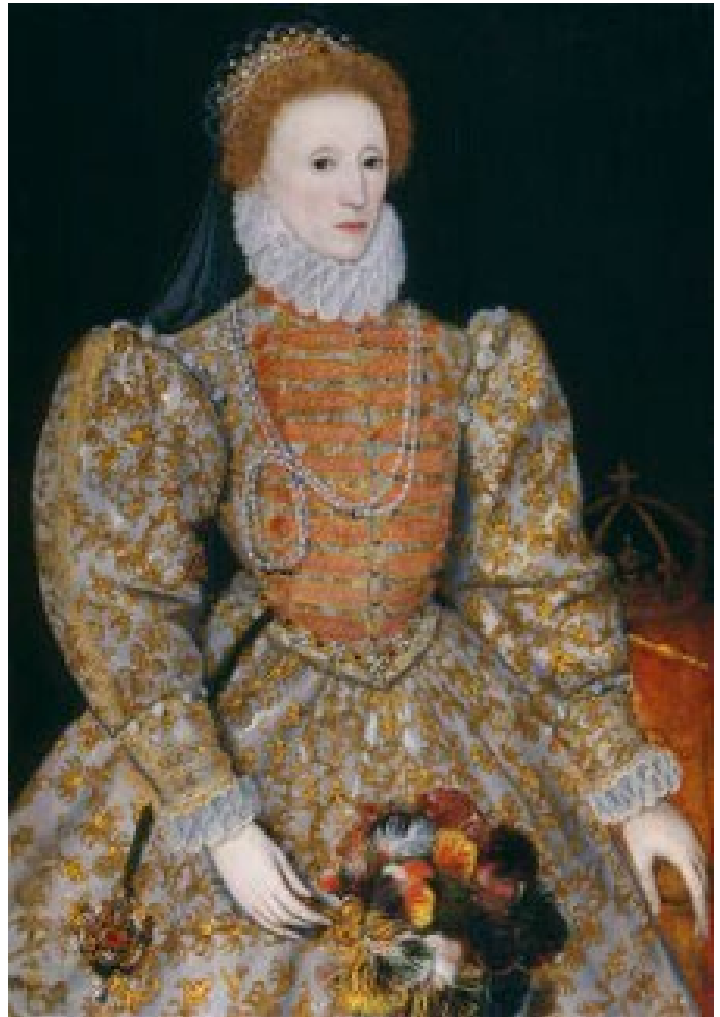
"Queen Elizabeth I" (The "Darnley Portrait") by an unknown artist, c.1575.

The Elizabethan Era is considered a "golden age" of art and culture in English history. During this time, there were two trends in art and communication that caused significant shifts in the country's cultural landscape—the