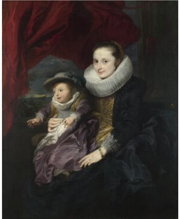
"Portrait of a Woman and Child" by Anthony van Dyck, 1620-1.

Because of the laws preventing women from owning and inheriting property, nearly all women in the Elizabethan Era married. Because marriage was an important aspect of society, there were many social and legal codes surrounding marriage practices. However, during the Elizabethan Era, marriage laws and practices began to shift slightly, allowing for a bit more marital freedom. For example, in 1604, a law was passed that allowed a man and woman to marry without the consent of either's parents. Before this period, marriages often functioned solely as alliances between families in order to protect or advance a family's wealth and social status. While marriages still often functioned like this in the Elizabethan Era, the new law appealed to the growing trend of placing affection and love at the core of a marriage.