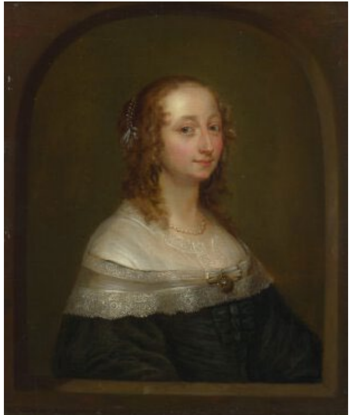
"Portrait of a Woman" by Imitator of Gonzales Coques, circa 1650.