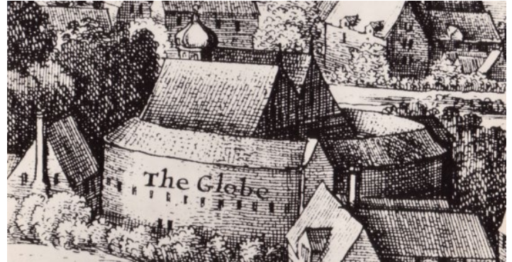
"The Original Globe Theatre," artist unknown.