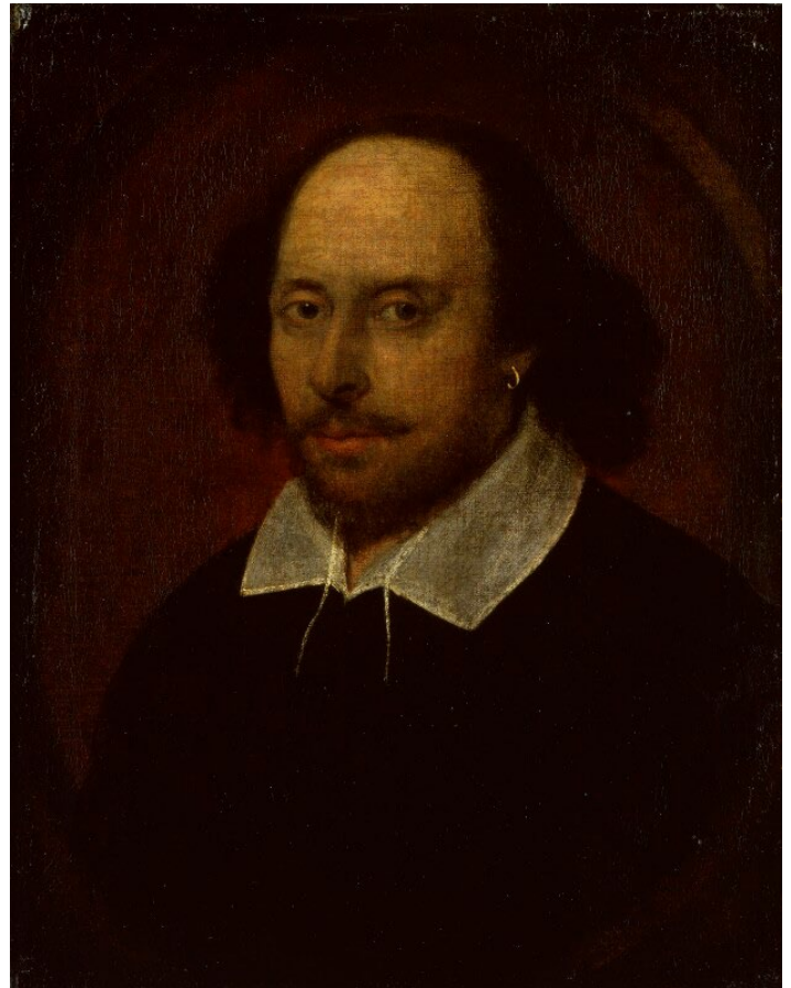
"William Shakespeare" associated with John Taylor, c. 1600-1610.

Over the course of about twenty years, Shakespeare created a staggering body of work including 154 sonnets,