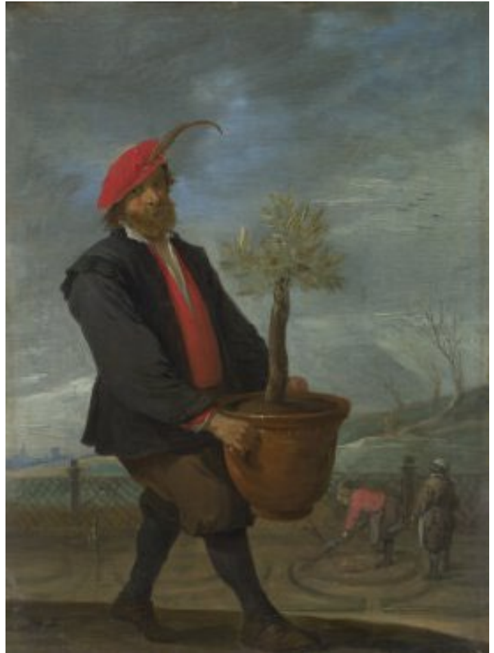
"Spring" by David Teniers the Younger, circa 1644.

In Sicilia, the springtime tone of the play continues as Leontes and Perdita are finally reunited. In their reunion, Leontes has a rebirth in his identity as he is once again able to be a father figure. What is more, when Paulina's statue of Hermione animates and transforms into the Hermione, the family, as a whole, is reborn—minus Mamillius. As the play comes to a close, it offers a promising and budding future for each of the living characters. ♦