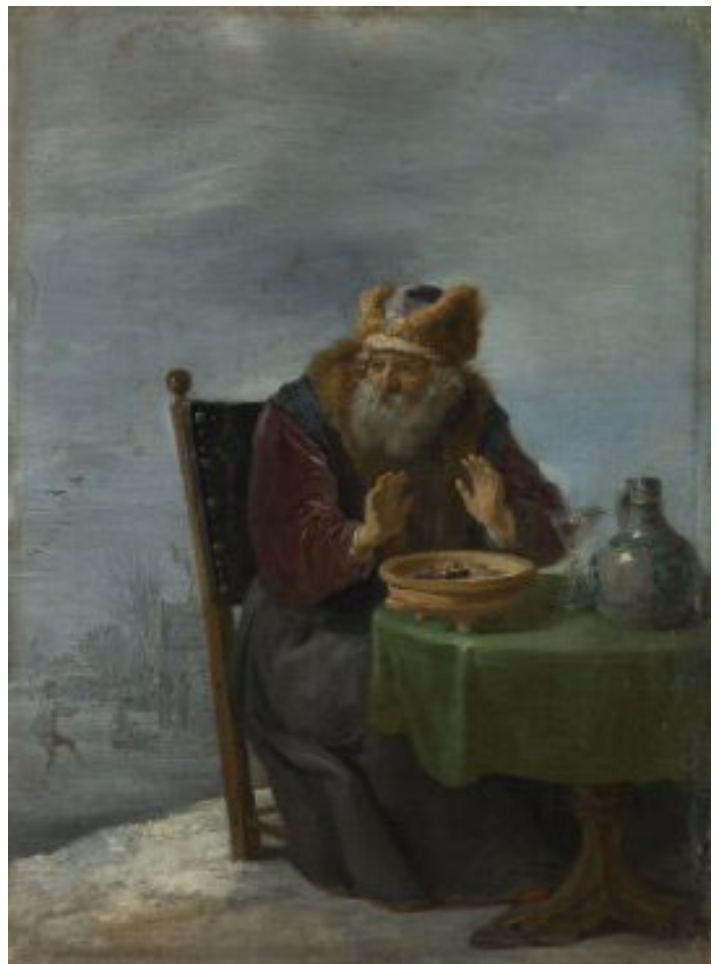
"Winter" by David Teniers the Younger, circa 1644

In the second half, the tone of the play becomes spring-like as the action of the play shifts its focus to the