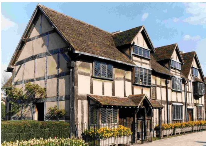
"Shakespeare's Birthplace," Stratford-upon-Avon.