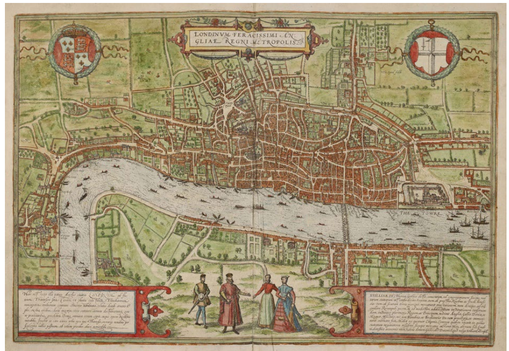
“Civitates Orbis Terrarum” Map of London by Georg Braun, Frans Hogenberg, and Joris Hoefnagel, c. 1600-1623.