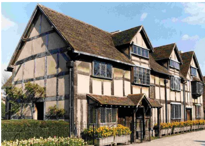
"Shakespeare's Birthplace," Stratford-upon-Avon.