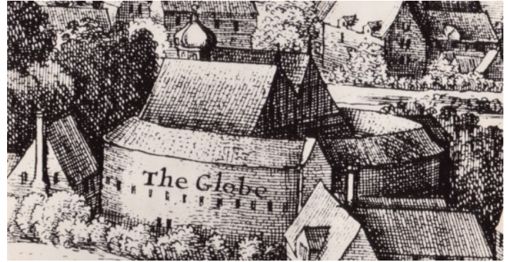
"The Original Globe Theatre," artist unknown.