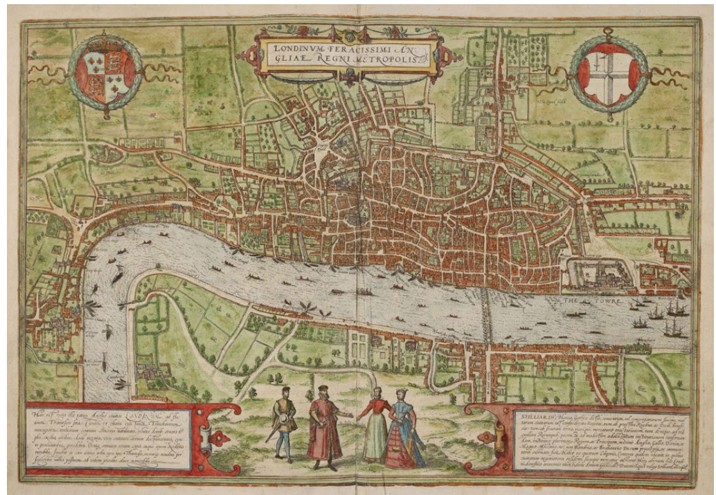
"Civitates Orbis Terrarum" Map of London by Georg Braun, Frans Hogenberg, and Joris Hoefnagel, c. 1600-1623.