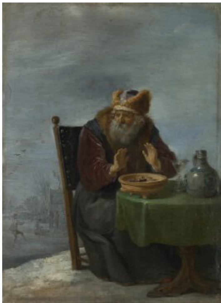
"Winter" by David Teniers the Younger, circa 1644

In the second half, the tone of the play becomes spring-like as the action of the play shifts its focus to the