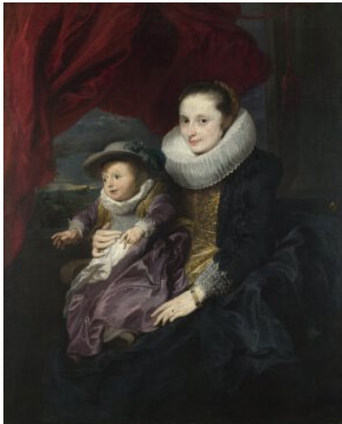
"Portrait of a Woman and Child" by Anthony van Dyck, 1620-1.

Because of the laws preventing women from owning and inheriting property, nearly all women in the Elizabethan Era married. Because marriage was an important aspect of society, there were many social and legal codes surrounding marriage practices. However, during the Elizabethan Era, marriage laws and practices began to shift slightly, allowing for a bit more marital freedom. For example, in 1604, a law was passed that allowed a man and woman to marry without the consent of either's parents. Before this period, marriages often functioned solely as alliances between families in order to protect or advance a family's wealth and social status. While marriages still often functioned like this in the Elizabethan Era, the new law appealed to the growing trend of placing affection and love at the core of a marriage.