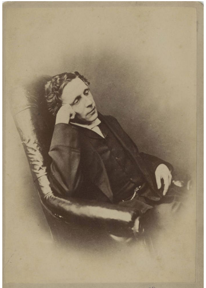
Charles Lutwidge Dodgson (Lewis Carroll) Self-Portrait, circa 1895.

As an instructor at Christ Church, Dodgson had difficulty commanding a room of undergraduates during his lectures—he had a quiet voice and severe stammer which made it challenging for him to keep order during classes. However, Dodgson was a gifted storyteller and would entertain the children who visited or lived near Christ Church with fantastical