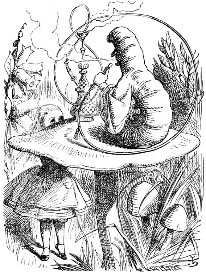
A picture of a caterpillar smoking a hookah. This image is artwork by John Tenniel, accompanying an edition of “Alice’s Adventures in Wonderland” by Lewis Carroll.

Logic, as Alice has come to know it in her familiar world, does not seem to exist as she knows it in