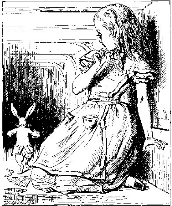
"Giant Alice watching Rabbit run away" by John Tenniel, Alice's Adventures in Wonderland 1865.