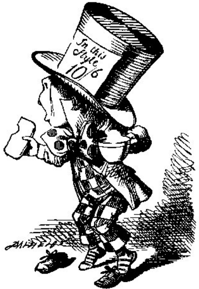
"Mad Hatter arrives hastily in court to testify" by John Tenniel, Alice's Adventures in Wonderland , 1865.