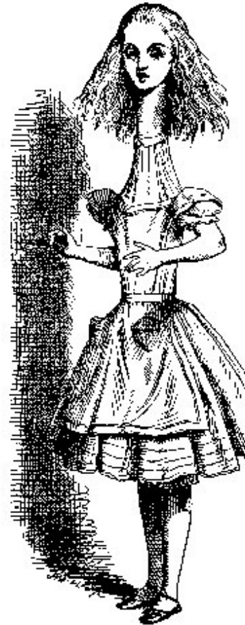
“Alice stretched tall” by John Tenniel, Alice’s Adventures in Wonderland , 1865.