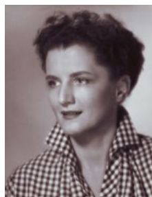
Florida Friebus, 1926.

In 1986, President Ronald Reagan awarded Le Gallienne with the National Medal of Arts for her contributions to the American theater. Le Gallienne continued to translate classic tales, write, act, and direct until the end of her life. Le Gallienne died on June 3, 1991 at the age of 92 from heart failure.