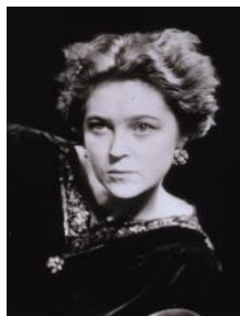
Eva Le Gallienne, circa 1927.