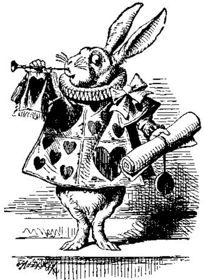
“White Rabbit, dressed as herald, blowing trumpet” by John Tenniel, Alice’s Adventures in Wonderland , 1865.