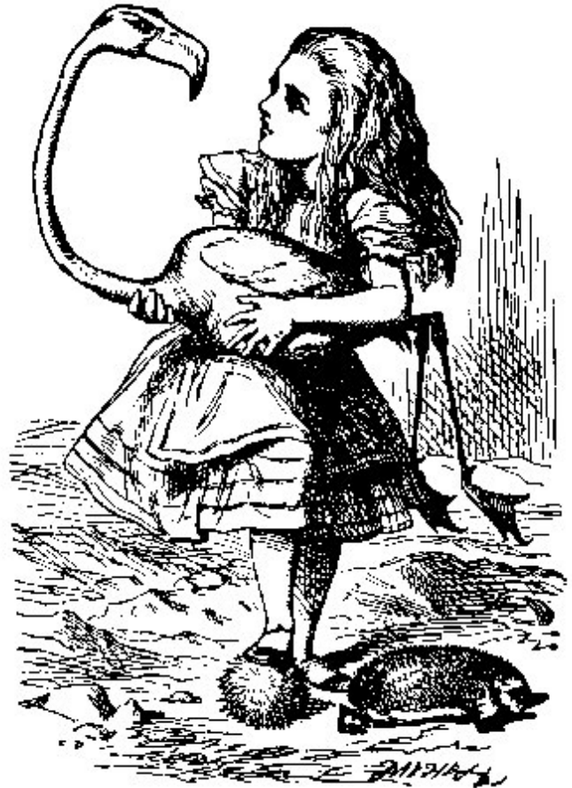
“Alice trying to play croquet with flamingo and hedgehog” by John Tenniel, Alice’s Adventures in Wonderland , 1865.