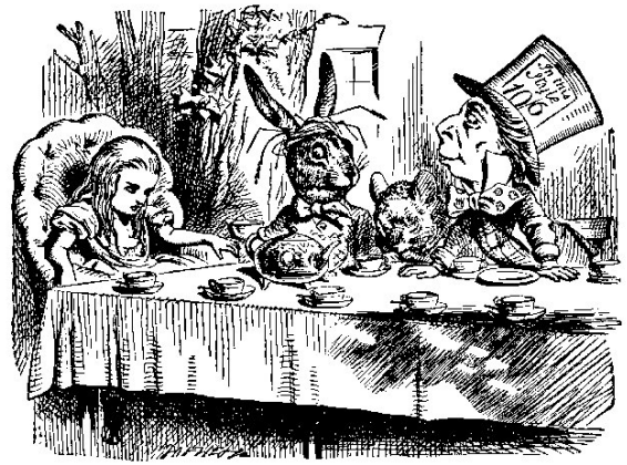
“Mad Tea Party” by John Tenniel, Alice’s Adventures in Wonderland (1865).

When Alice leaves the tea party, she finds herself in the Queen of Hearts’ garden. The Queen of Hearts invites Alice to a game of croquet in which upside-down flamingos are used as mallets. Alice has some trouble playing with these mallets, but the game is