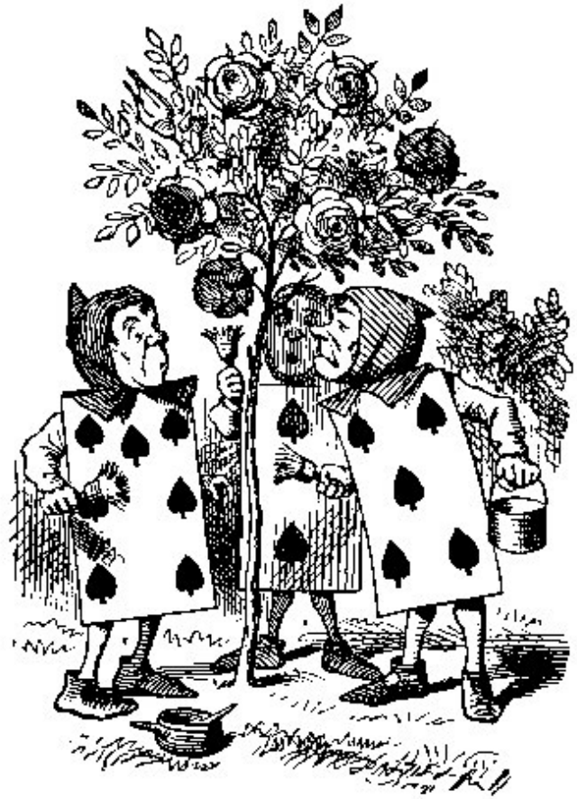
“Two, Five, and Seven painting the rosebush” by John Tenniel, Alice's Adventures in Wonderland , 1865.

While cards and chess are the most apparent and predominant games in the action of Alice's